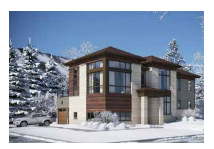
ELEVATION A 3,956 SQ.FT