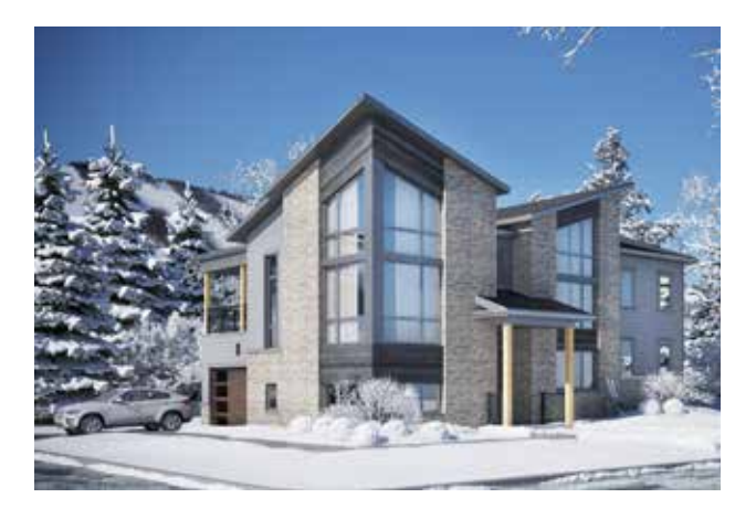
ELEVATION B 3,960 SQ.FT