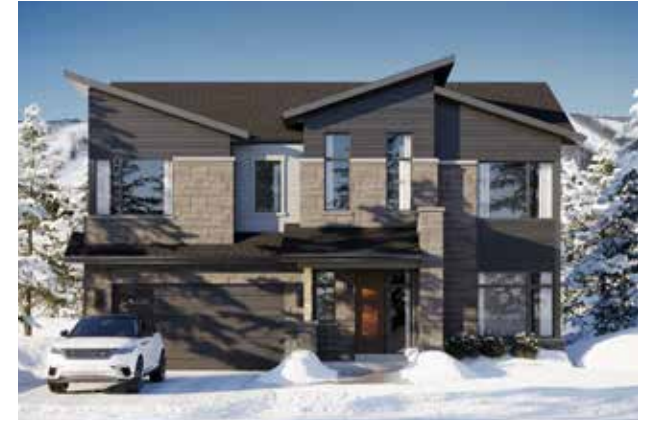
ELEVATION B 2,994 SQ.FT