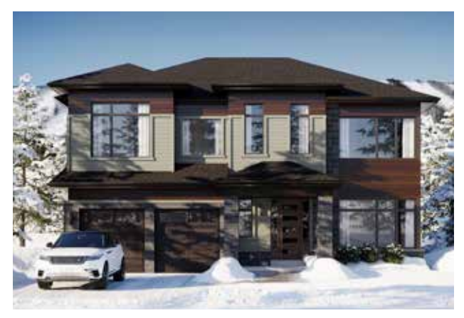
ELEVATION A 2,981 SQ.FT